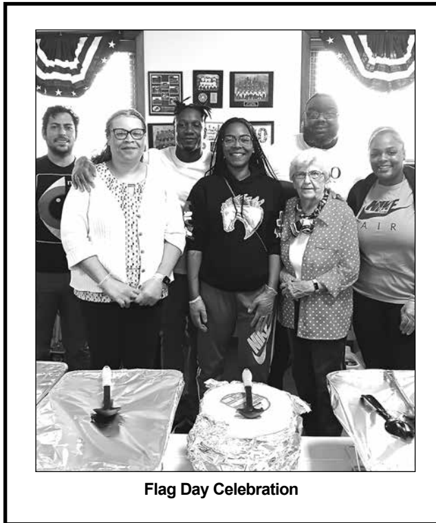
Flag Day Celebration

Our year round Food Pantry program numbers were higher again this year, as many Covid programs were retired and people received less help so they have been coming to the